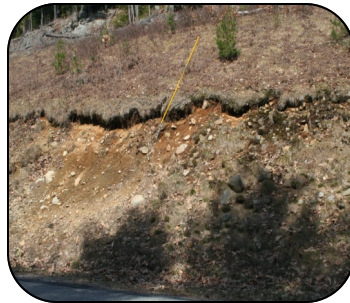
Town of Bolton, Warren County