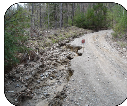
Tropical Storm Irene Aftermath: Road washout, Town of Westport, Essex County.