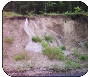
Town of Harrietstown, Franklin County