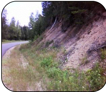
Town of Saranac, Clinton County

A copy of the entire report is available through a link on www.cwicny.org .