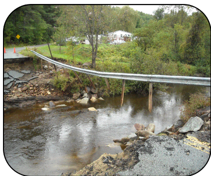
Tropical Storm Irene Aftermath: Road washout, Spruce Mill Brook Rte 12, Town of Lewis, Essex County.

In 2011, the Lake Champlain watershed experienced catastrophic hydrologic events that amounted to widespread devastating environmental and economic impacts. Spring floods and lake shore erosion, along with massive upland stream erosion caused by Tropical Storms Irene and Lee, resulted in a high number of distressed areas in critical need of substantial remediation. CWICNY continues to work cooperatively with local partners, municipalities and landowners to repair damage, strengthen infrastructure and improve water quality throughout the watershed.