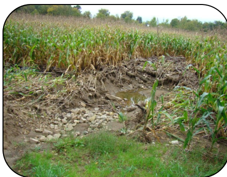
Tropical Storm Irene Aftermath: Access road washed into a 30 acre corn field, Town of Mooers, Clinton County.